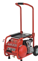
Compressor ALAIR 20/255 Code : AL57170