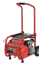
Compressor ALAIR 20/255 Code : AL57170