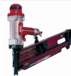
High pressure pneumatic nailers Code : HS130