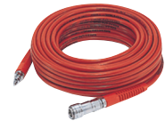
High pressure hose Code : R0804