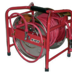
High pressure hose reel Code : EA028030