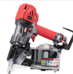
High pressure pneumatic nailers Code : HN65S